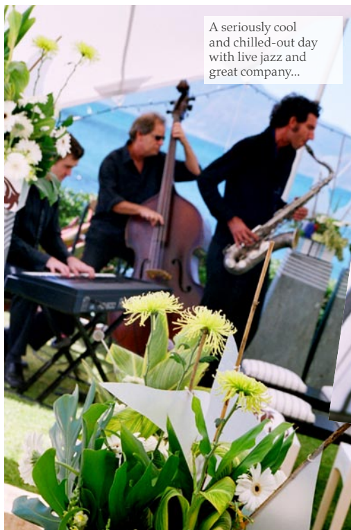
A seriously cool and chilled-out day with live jazz and great company...