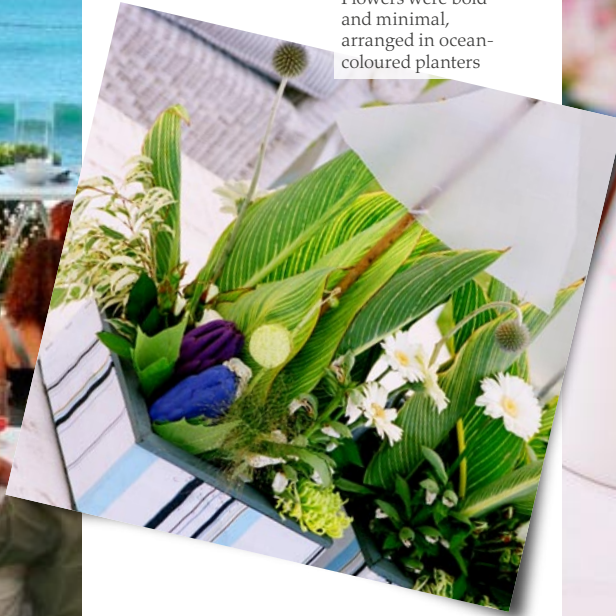
Flowers were bold and minimal, arranged in ocean-coloured planters