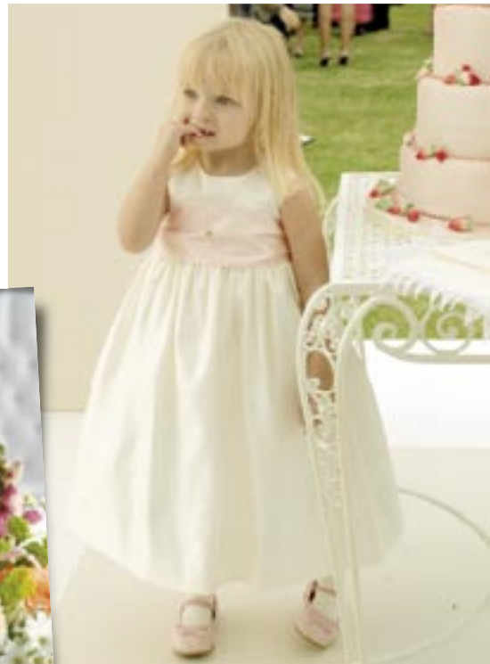
The vanilla wedding cake was covered in pastel pink icing sugar and decorated with little sugar icing strawberries