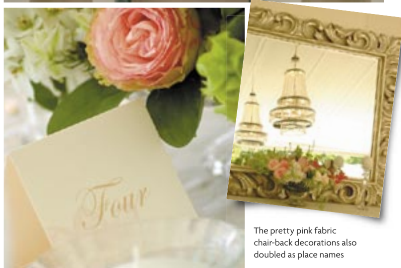
The pretty pink fabric chair-back decorations also doubled as place names