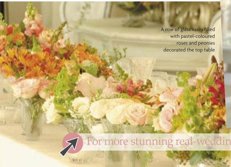
A row of glass vases filled with pastel-coloured roses and peonies decorated the top table